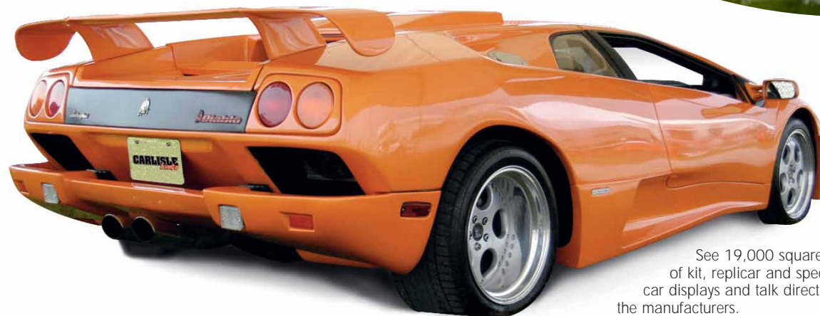
See 19,000 square feet of kit, replicar and specialty car displays and talk directly to the manufacturers.