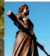
...Molly Pitcher, Revolutionary War icon, was born and is buried in Carlisle?