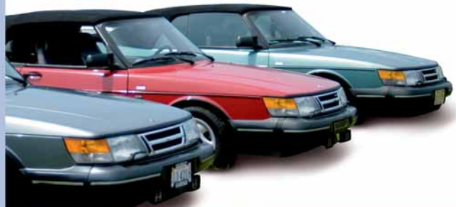
The Saabs at Carlisle club had the highest club participation in 2004.

Take home a trophy! This event is the perfect place to get together for a club gathering. Trophies are awarded to the three clubs with the highest participation. And, if club members pre-register at least 25 cars before April 21, your club can receive free rental of a club tent. Club officials may call or go online for a tent reservation form. Sign up your club today. This year, the NSU and East Coast Speedster clubs are holding their national meets during the event.