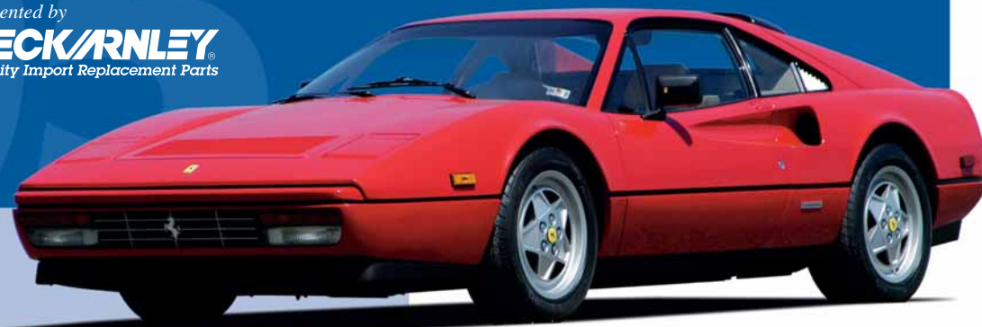
See this Ferrari 328 GTB with the invitational display at the event.

Presented by BECK/ARNLEY Quality Import Replacement Parts